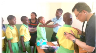
(Medical Service, Fellowship Church, U.S.A)

With this complete state of art ultra-modern leaning complex, students are able to learn in a serene and conducive environment. We have a team of highly qualified and dedicated teachers whose passion and commitment is to see our children grow not only being academically knowledgeable but grow in the fear, admonish and knowledge of our Lord and savior Jesus Christ. That is our Kingdom business!