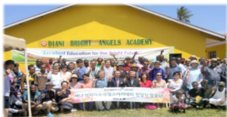
(School Building Dedication Ceremony)

February was a very busy but happy month. On 28th we held our new school's dedication ceremony. On this special day, we really saw God from the amazing number of attendees (including more than twenty visitors from South Korea) and how the day's activities unfolded especially with the donation of a school bus.