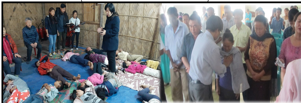
At Awakening Fellowship