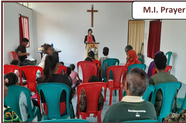
M.I. Prayer House