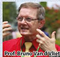
Principal of South Asia Institute of Theology, the Norton Bridge Sri Lanka.

There are 5 poetic books in the Old Testament; Direction Magazine published articles on the book of Job and the book of Proverbs ("Is the book of Proverbs Multi-sourced"). Old Testament poetry expresses thought about God in a deep meditative fashion. We see God presented by poets in ways we don't see Him presented anywhere else. When we take the time to listen to the poet's message, we can genuinely delight in the Law of the Lord. Let God speak to the depths of our souls by urging your mind and your heart to work with the Hebrew poet. You have to think, pray, and meditate when you read Old Testament poetry, but the fruit is worth the effort.