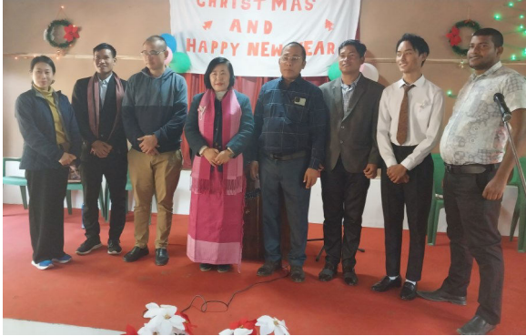
Zion Hindi Baptist Church