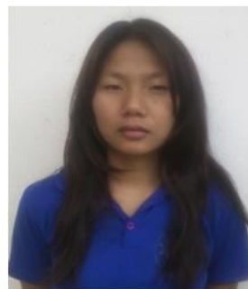
Vung Ngaih Huai