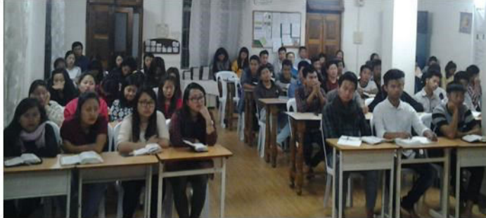
A group of students in blue uniforms are seated at wooden desks in a classroom, smiling for a group photo. The room has large windows and a blackboard in the background.