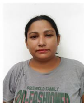
Salomi Under Matriculate Sweeper