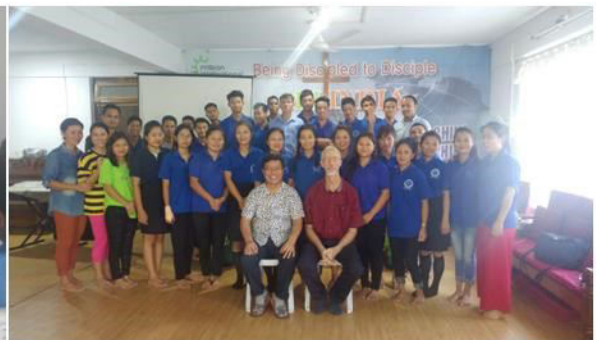
Praise & Worship Seminar