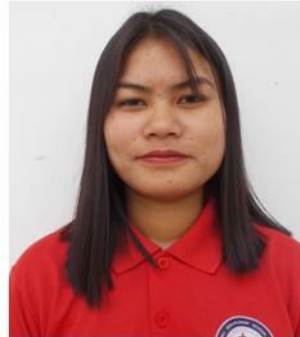
Climing Rung Reang