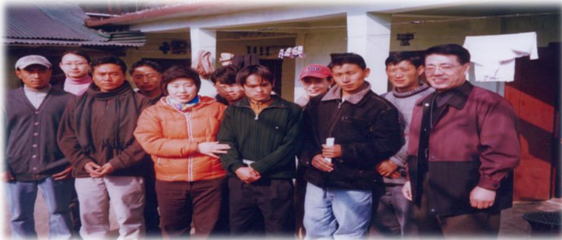
1. M. I. Intensive English Bible Camp: Aug. 16-23, 2006