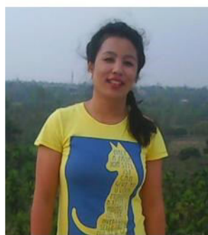
Athing Under Matriculate Cook