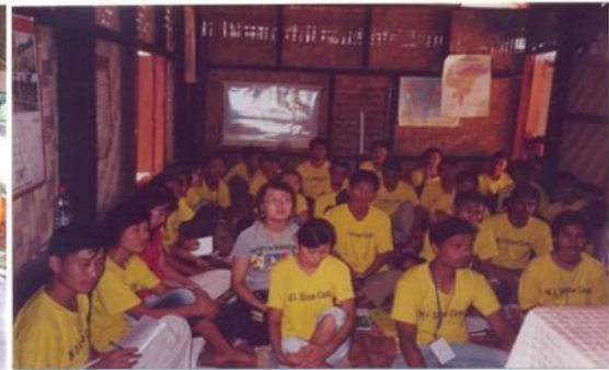
3. M. I. Shine Camp: July 20 -Aug. 20, 2007