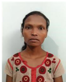
Remika Under Matriculate Sweeper