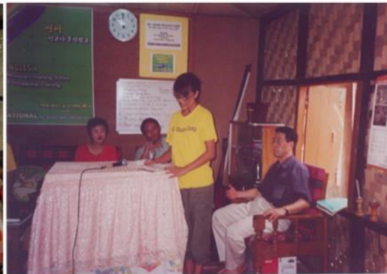
4. M. I. Vision Camp: Dec. 15, 2007-Jan. 15, 2008