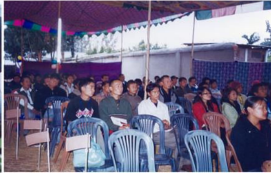
2. M. I. Arise Mission Camp: Feb. 16-20, 2007