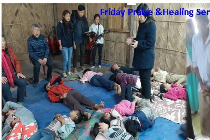
Friday Prayer & Healing Service