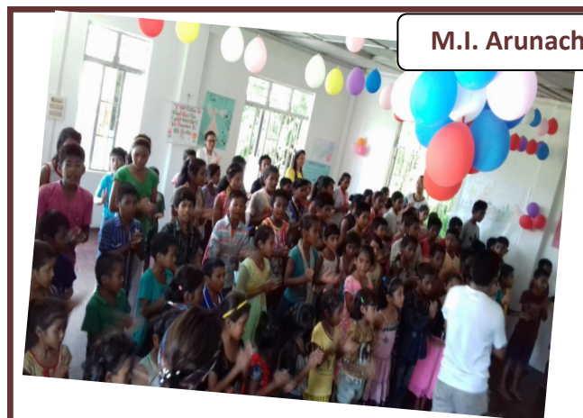
M.I. Arunachal Pradesh