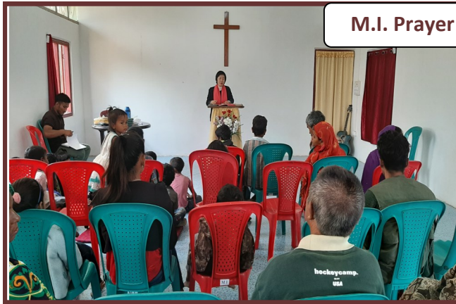
M.I. Prayer House