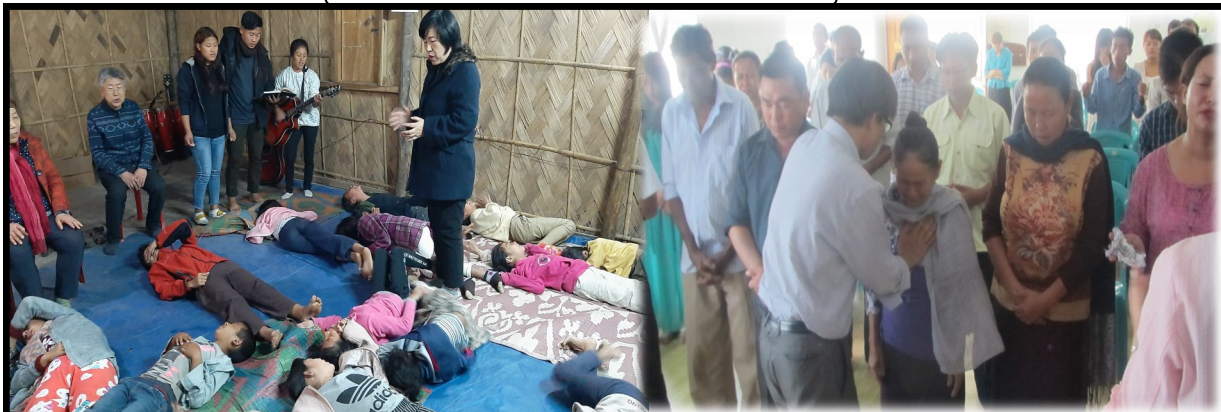
At Awakening Fellowship